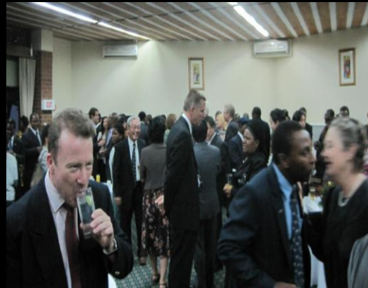
A cross section of guests mingling