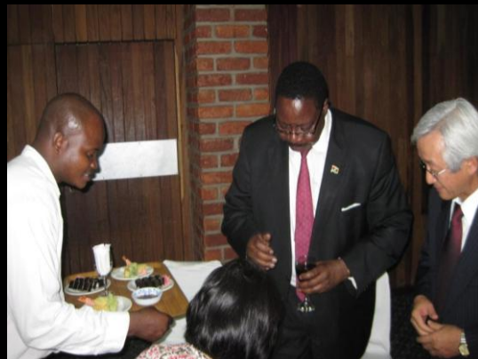
The Guest of Honour being treated to Japanese delicacies