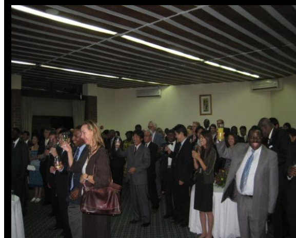
Guests toast to the health and success of the Emperor