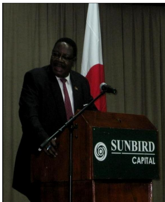
The Guest of Honour, Hon. Prof Arthur Peter Mutharika delivering his remarks

After the speeches, guests were treated to a variety of finger snacks and Japanese delicacies such as vegetable and prawn tempura, and sushi as they mingled around.