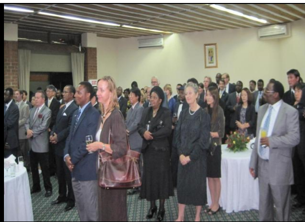
Guests listening attentively to speeches

Hon Prof. Arthur Peter Mutharika, on the other hand, began his remarks by conveying a best wishes and congratulatory message from H.E. President Bingu wa Mutharika to His Majesty Emperor Akihito and the people of Japan. He then thanked the Government of Japan for contributing to Malawi's development even when faced with challenges such as natural disasters and economic slow-downs.