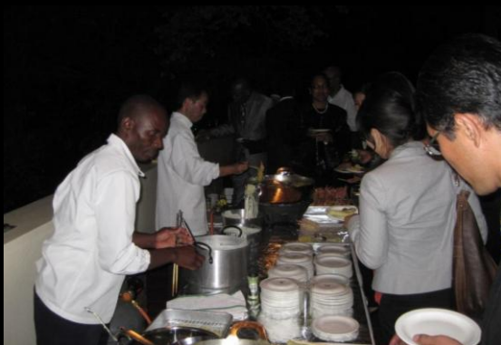
Guests sampling Japanese dishes